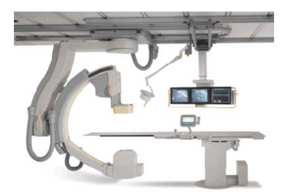
Figure 1. Allura Xper system.

Philips started its medical activities in 1918, when it first introduced a medical X-ray tube. In 1933 Philips started